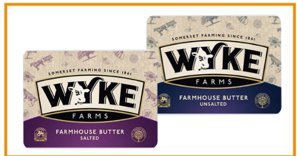
Wyke Farm Butter 20x250g Wyke Farms only use the creamiest milk from cows roaming the lush, green pastures of the Mendip hills to craft their butter. A local favourite for over a century. Salted • Unsalted.