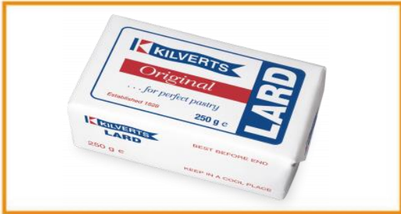
Kilverts Lard 24x250g

(BRIERLEY HILL) LIMITED CHEESE, YOGURT & A WHOLE LOT MORE