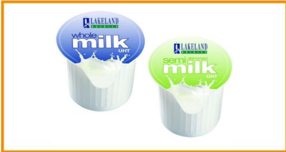
Lakeland Portions 120x12ml Ambient 12ml portions. The single serve portions are hygienic and convenient. Ideal for use in tea & coffee. Whole • Semi