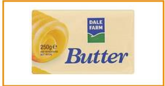
Dale Farm Butter 20x250g Produced with British Red Tractor milk with full BRC Grade A and Halal accreditation. Salted • Unsalted.