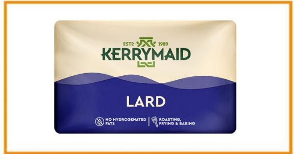
Kerrymaid Lard 40x250g

Most used in baking. It is particularly favoured in pastry making because of the flakiness it brings to the finished product.