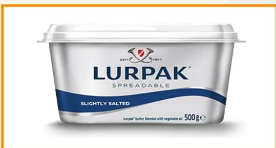
Lurpak Slightly Salted 20x250g Made from 100% fresh milk with its subtlety and freshness, it is perfect for all kinds of food adventures, be it baking, spreading, drizzling mixing, frying...