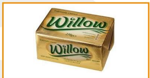
Willow 20x250g A delicious alternative to butter, Willow has all the traditional cooking and baking features of butter, with the benefit of spread.