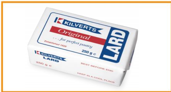
Kilverts Lard 24x250g

Kerrymaid lard is a fantastically versatile product. It can be used for baking, roasting, frying and shallow frying. Perfect for homemade chips and short crust pastries.