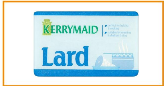
Kerrymaid Lard 40x250g

A 70% fat sunflower spread. Available in delightful little 10g dishes. Vegan friendly.