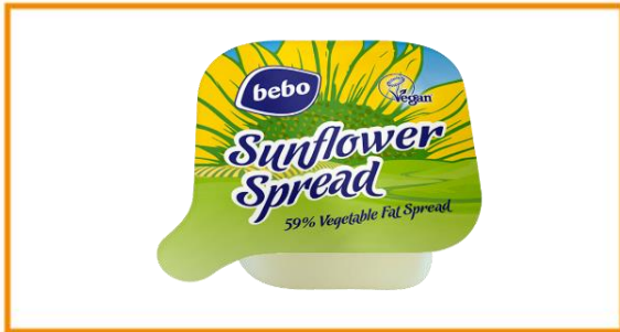
Bebo Sunflower Portions 4x100x10g

(BRIERLEY HILL) LIMITED CHEESE, YOGURT & A WHOLE LOT MORE